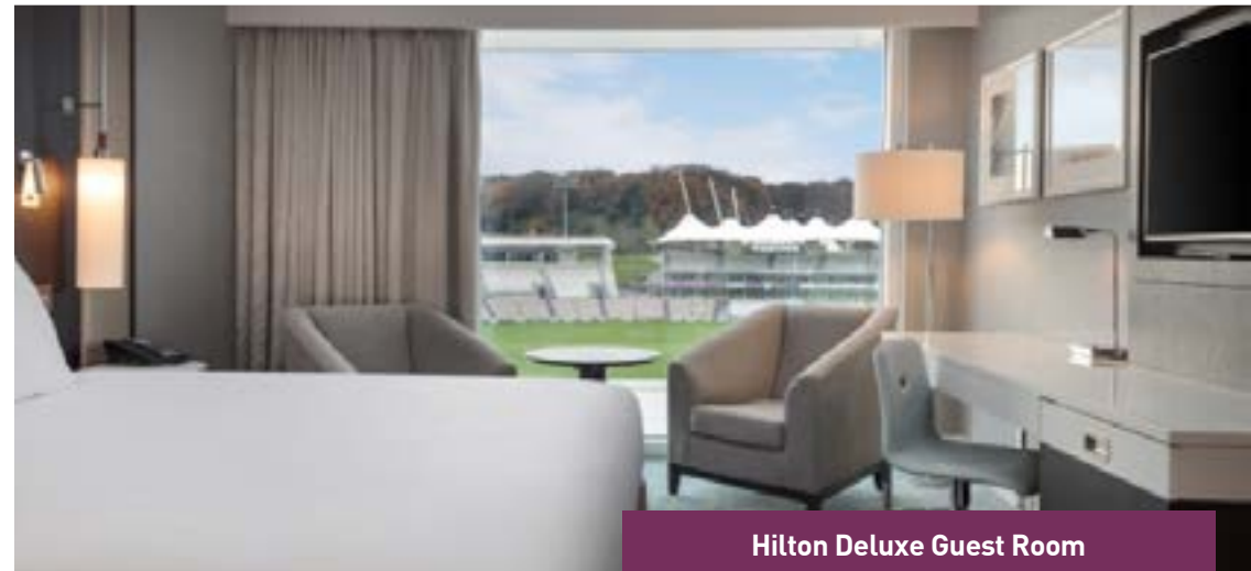
Hilton Deluxe Guest Room