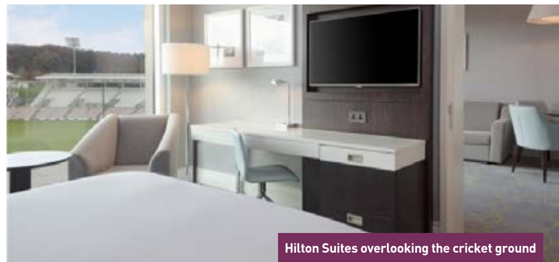
Hilton Suites overlooking the cricket ground