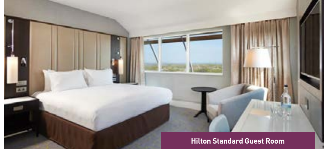
Hilton Standard Guest Room

We also offer the 15% off best available rate allocation of rooms.