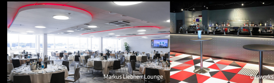
Markus Liebherr Lounge