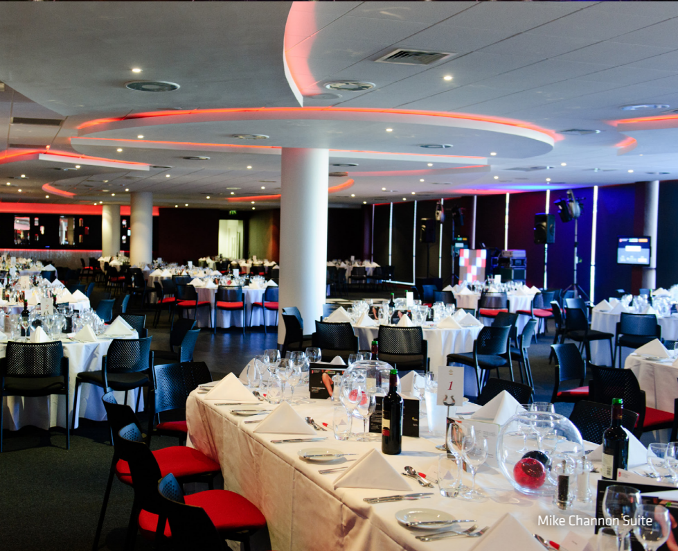
Mike Channon Suite